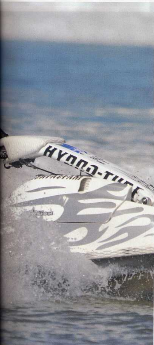
One-handed barrel roll