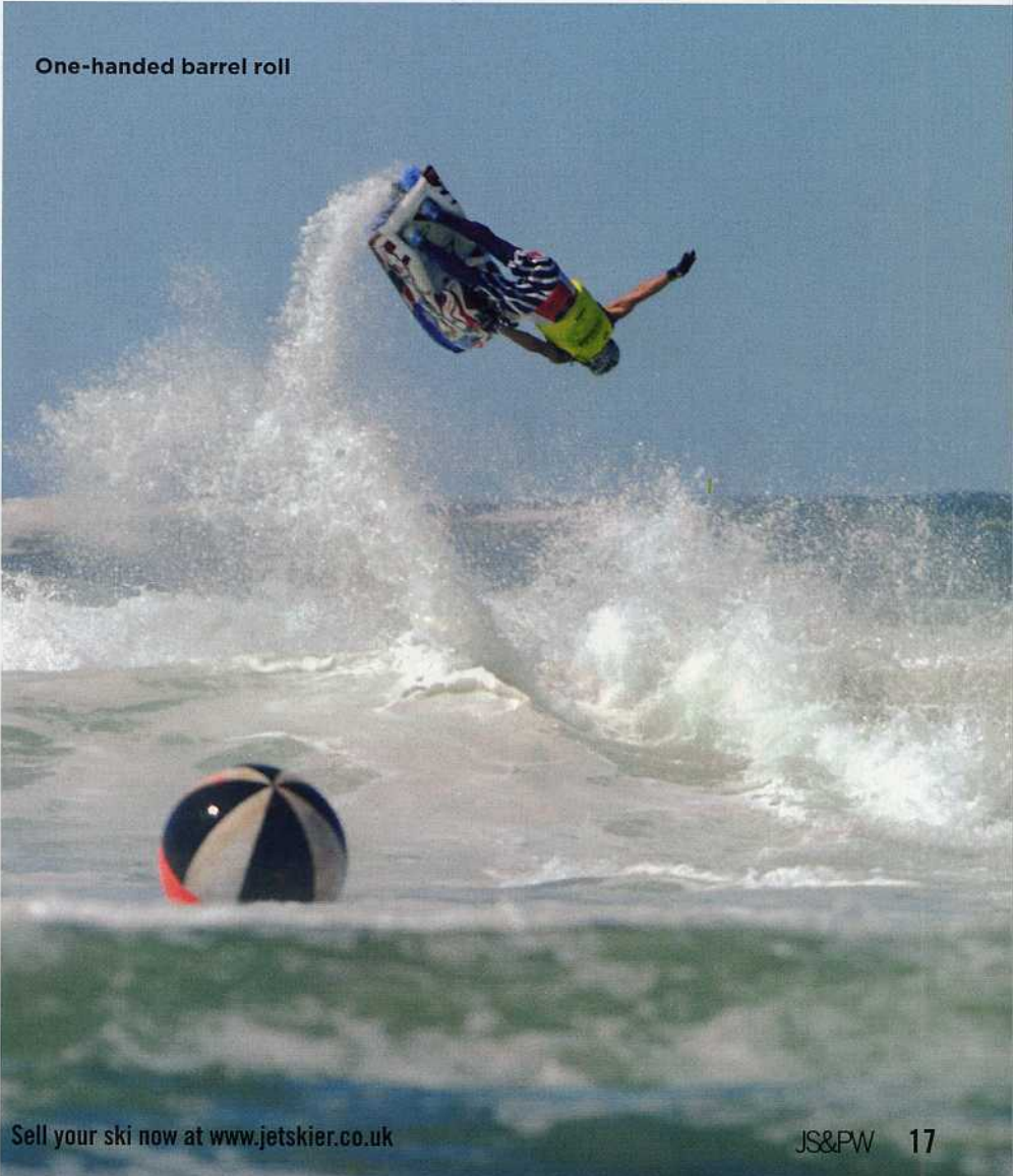
One-handed barrel roll